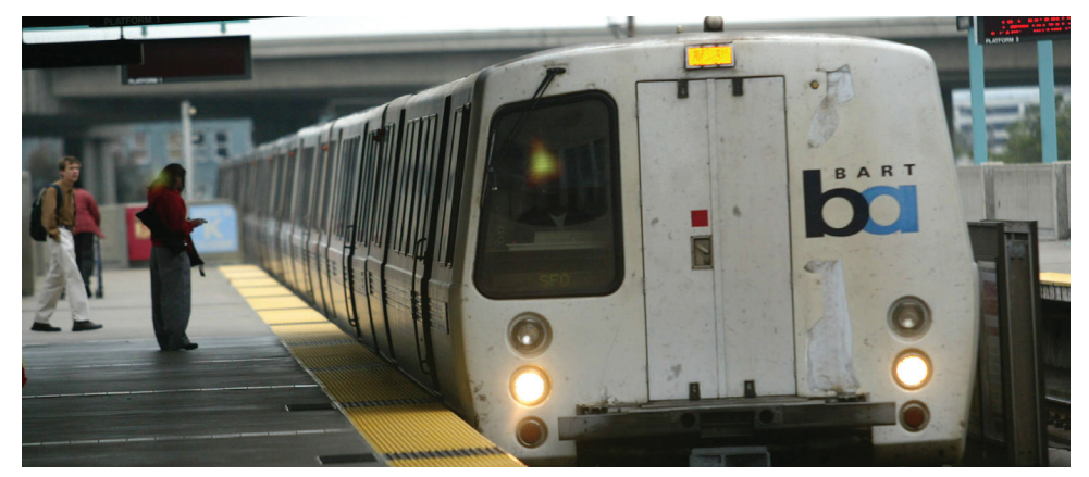
A new poll found strong support for a $3 billion bond measure to improve BART service and trains.